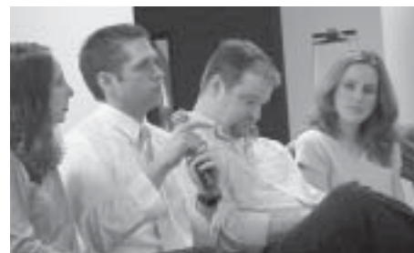
A panel of NHBC alumni gave insight into what Bible College life is like, and how it has been part of building a firm foundation in their lives.

Call 660-284-4800 for an NHBC info packet, or visit www.nationsharvest.org