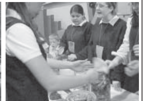
In the traditional HCA "penny war", students raised $755.14 for the missions fund.