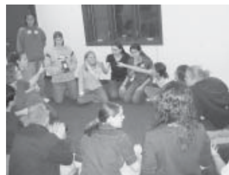
Students got to know each other at Thursday "family night" activities.