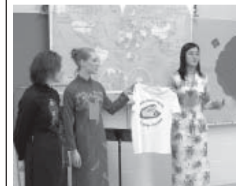
International dress, food, and lifestyles were the topics of HCA student missions presentations.